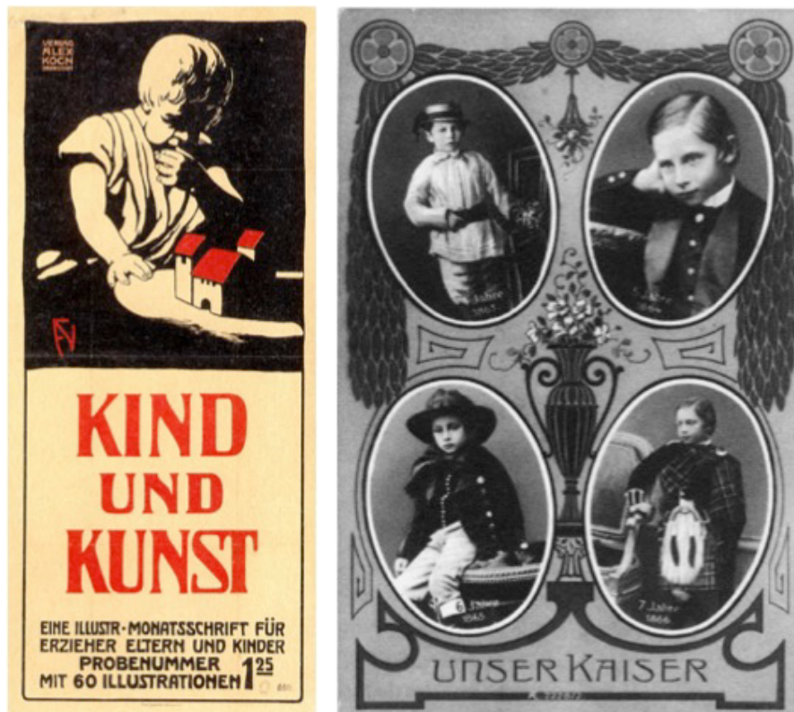
Fig. 2: Cover of the "Kind und Kunst" magazine (1901).

shows a child with a model. The child, in the pose of the thinker and immersed in the model, becomes the creator of their own world, and seems to be reflecting, planning or designing (see Fig. 2). In this reflection of childhood, markers of the modernization of society as a whole, but subsequently also of the realities of children's lives, become apparent. The large, childlike head and hand are reminiscent of models and miniatures, the double game with scale shows the examination of the question of what role children have and play. If we look into children's rooms a hundred years later, we see an unbroken fascination for the model as well as the recurring questions about the role of children, about the shaping of childhood as well as about toys. The boundless possibilities and themes are depicted in an infinite spectrum.