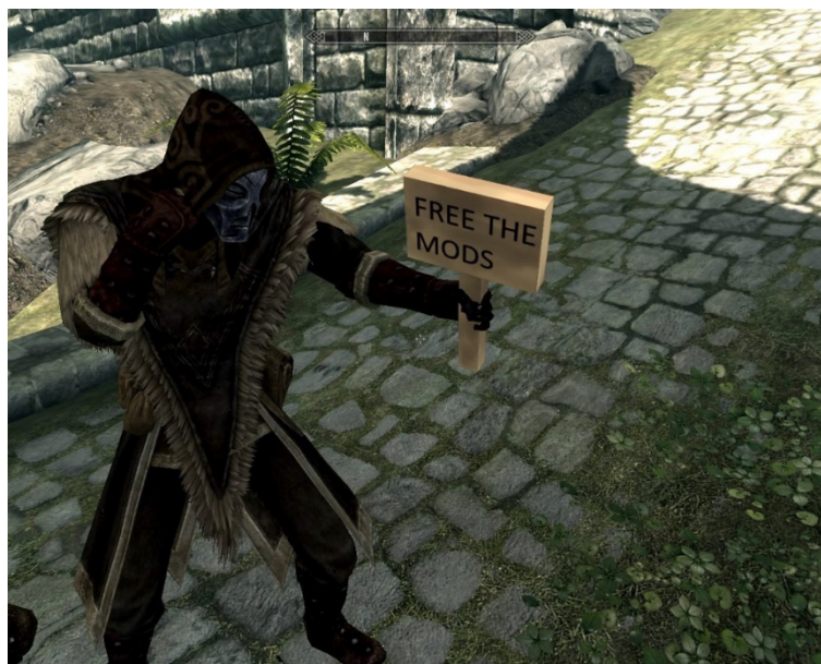
Fig. 1: SKYRIM mod “Protest sign: No paying for mods”. (Source: https://steamcommunity.com/sharedfiles/filedetails/?id=431467621 , Accessed May 21, 2022)

Even in the rare cases that companies directly pay modders for their work or pay them shares when mods are getting monetized, the suspicion of precarious labor is perhaps not unfounded, and publishers have been called out for this in the past. In 2015, Valve and Bethesda introduced their concept of ‘paid mods’ to the Steam Workshop . The short-lived, optional feature allowed users to offer their mods for sale at a fixed rate or as a ‘pay-what-you-want’ proposal. The earnings were then split amongst Valve , Bethesda , and the respective creator, with the latter earning 25% of the revenue. This introduction of paid mods caused great backlash among both modders and players, and resulted in an influx of complaints, petitions and protest, some of it actually through modding: After user amuz-quiz had uploaded a digital protest sign with slogans like “Free the Mods” and “No Paid Mods” for the characters of SKYRIM to hold up (see Fig. 1), it briefly became the most popular mod on Steam Workshop .